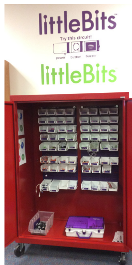
More ideas clipped with magnets inside