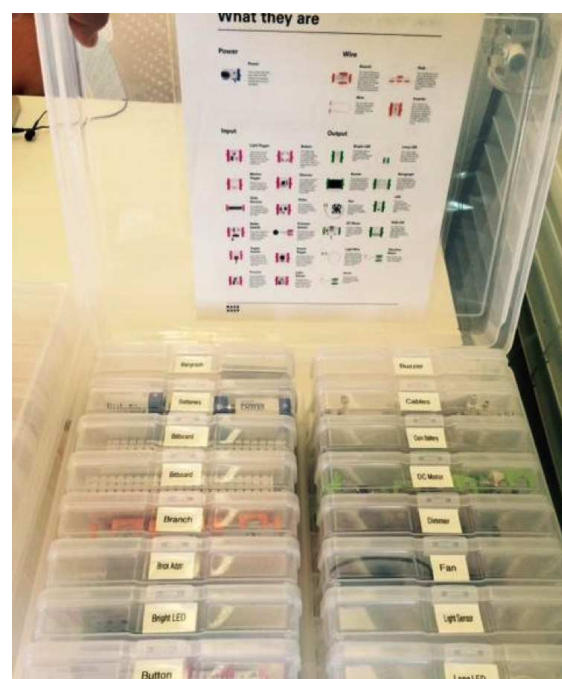
PHOTO BY Angela Mackenzie of Iris Large Photo keepers containing littleBits

However, you might need your Bits more clearly organized for a guided activity or lesson. This teacher has her Bits sorted into clearly labeled photo storage boxes so that you can see the Bits and they stay organized. A tackle box is another way to make your Bits organized, approachable, and easily viewable. You might even consider storing littleBits Kits in toolboxes so you can make your Bits more portable for circulation.