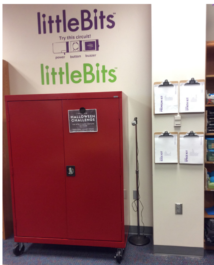
Locking cabinet and project clipboards

For example, during our Art Bot Challenge 6 , I covered our tables with white butcher paper, put power Bits and DC motors in colorful yellow bins, and then placed various art and craft supplies at the tables. I shared Art Bots from the littleBits website, and my students were inspired by other makers' creations. We did quick sketches, prototyped Art Bots, and tested their functionality directly on my classroom tables. (This is why it's important to have butcher paper on the tables.)